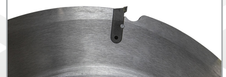
Enlarged view of tooth

Now sold through Arrow Material Handling Products